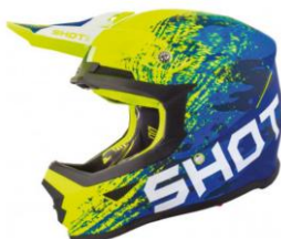
cross helmet with mouthguard