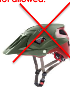
bike helmet or riding helmet