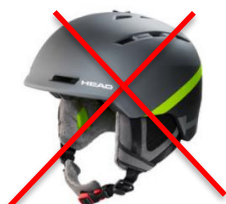
Helmet with „soft ear padding“ (normal tourist ski helmet)

Here are some examples of helmets which are not allowed :