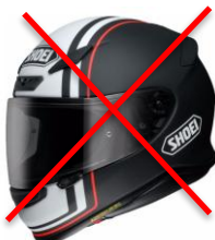
motorcycle full face helmet