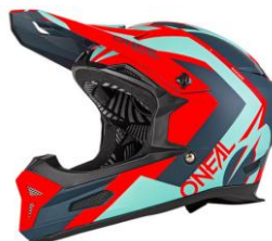
cross helmet with mouthguard