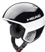
Full shell helmet

Here are some examples of permitted helmets: